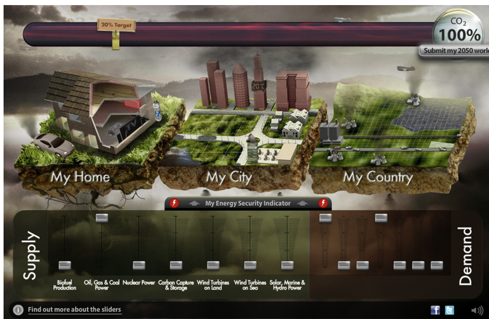
Fig. 2. The my2050 scenario tool illustrating the seven supply-side sliders. The tool is a simplified representation of the UK energy system. It enables exploration of different supply and demand-side options (including nuclear energy, fossil fuel generation, renewables, demand reduction, low carbon transport and heating systems, lifestyle changes) in order to reduce the UK’s carbon emissions by 80% compared to 1990. It was initially developed by the digital democracy company Delib for the UK Department of Energy and Climate Change and Sciencewise-ERC. A version of this tool can be found here: www.my2050.decc.gov.uk . (Contains public sector information licensed under the United Kingdom’s Open Government License v2.0).

Collecting multiple datasets using multiple methods was a deliberate design choice and it was important to include an analytic phase which explicitly brought the different research strands together to understand their combined insight. The qualitative and quantitative elements offered different qualities that were important to the synthesis analysis. For example, the survey was able to provide a certain weight to particular findings due to its large nationally representative sample (e.g. the strong preference to reduce fossil fuels), whereas the flexibility of the